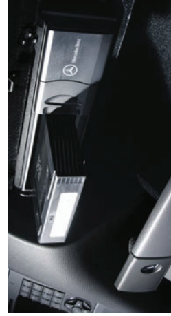
Optional glovebox-mounted 6-CD changer