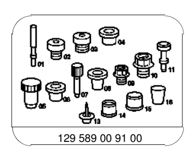
Set of stop plugs